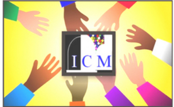
Iredell Christian Ministries (ICM)

The FPC Preschool is collecting canned food to be donated to those members of our community that are in need during this season. Please join us in supporting this cause and helping our preschool children learn the important lessons about giving and helping others. We are encouraging each child to bring in at least ONE canned food item.